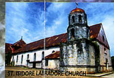
ST. ISIDORE LABRADORE CHURCH

Constructed by the Spaniards in 1884 the Lazi convent is assumed to be the biggest and the oldest in whole Asia. It is believed to have been the vacation house for the Diocese's priest at that time.