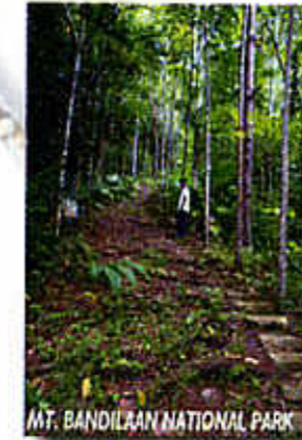
MT. BANDILAN NATIONAL PARK

Being the most famous of Siquijor's over 45 caves, Cantabon cave's long, winding and difficult trek is both a challenge and a delight to any spelunker. Inside the cave a subterranean stream and beautiful stalactites and stalagmites abound the cave's huge chambers.