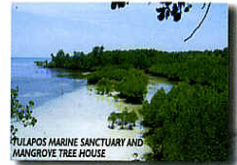
TULAPOS MARINE SANCTUARY AND MANGROVE TREE HOUSE

This preserved rainforest is home to numerous and diverse endemic fauna and flora and several caves and natural springs. Other attractions include a shrine of Our Lady of Lourdes and The Way of the Cross up to the top of the mountain.