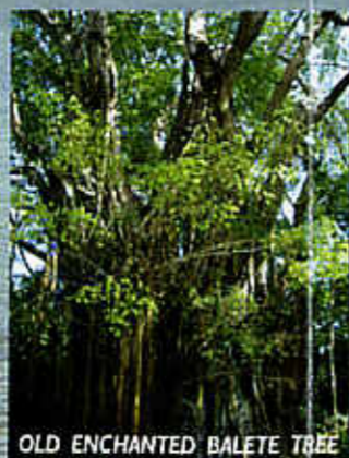
OLD ENCHANTED BALETE TREE

Cambugahay falls is the only enchanted falls in the island. See its several levels of waterfalls and enjoy its cool and refreshing waters. Secluded and relatively unexplored, the waterfalls surely invite trekkers for a refreshing dip.